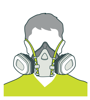
FIGURE 3: Reusable half-face respirator (cartridge)

Reusable and disposable respirators must be fit tested to ensure they fit the wearer's face properly. A fit test checks the seal between the respirator and the wearer's face: