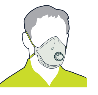
FIGURE 2: Disposable half-face respirator

Examples of suitable reusable and disposable RPE are shown below. Don't use 'nuisance dust masks' as they will not protect workers' health.